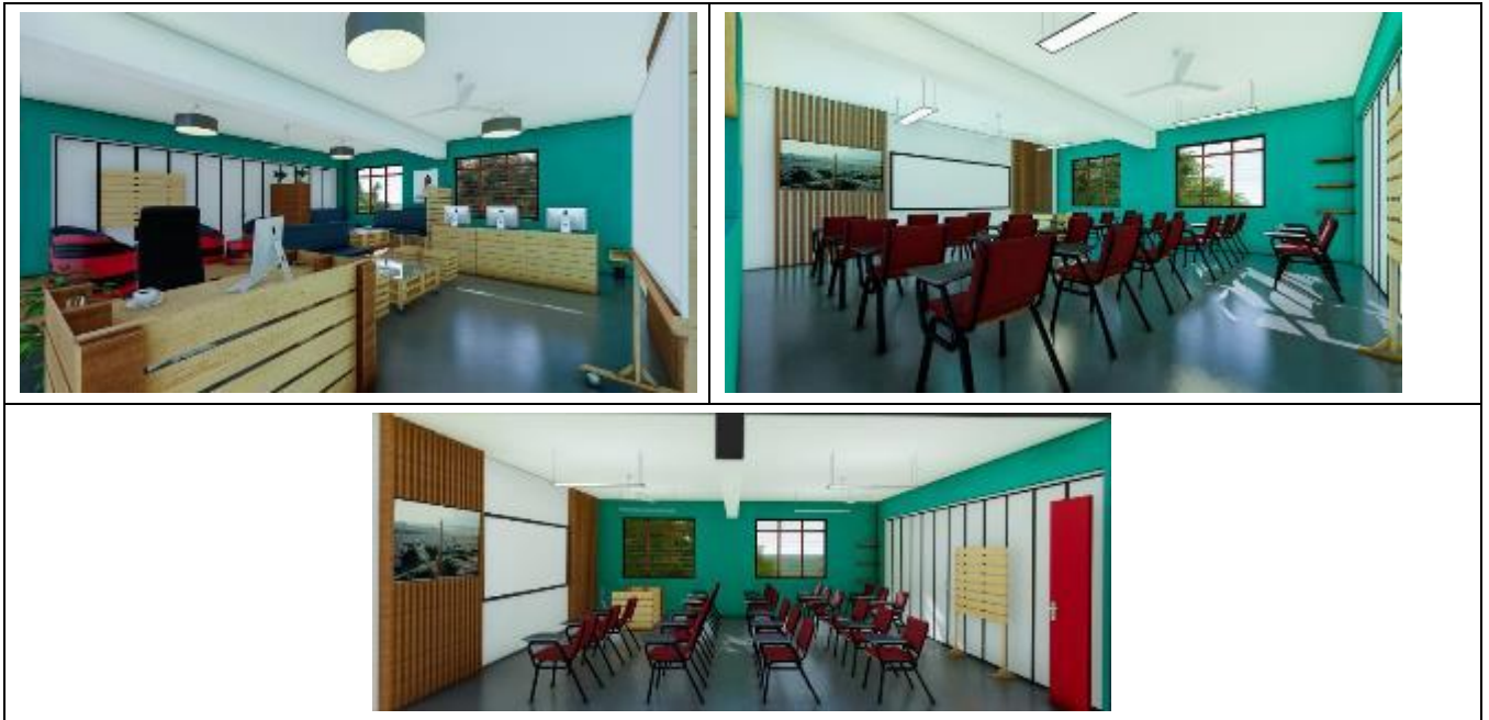
Figure 2 Architectural illustration of the imagined innovation hub

We propose repurposing a large classroom to serve as a physical innovation hub in TUM. It will involve redesigning the interior of the room, reinforcing it with security grills as well as furnishing it. This will be to make the hub attractive and conducive for both TUM faculty and students as well as top executives from external stakeholders. Figure 2 shows an architectural illustration of the imagined innovation hub.