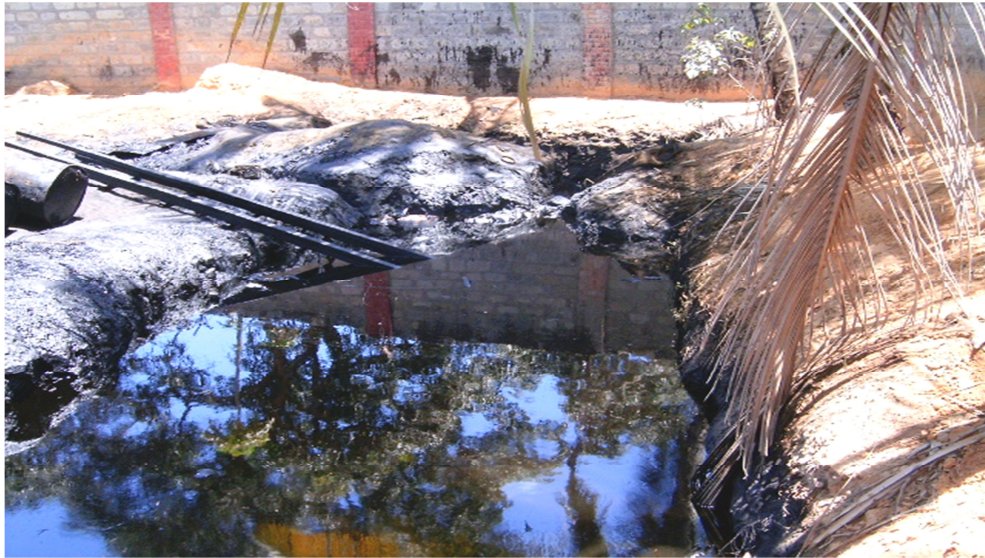
Fig. 1: The shallow wastewater receiving and holding pond. Note the dark fuel oil skimmed from the pond