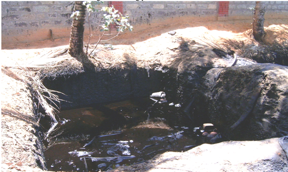
Fig. 2: The second deeper wastewater storage pond