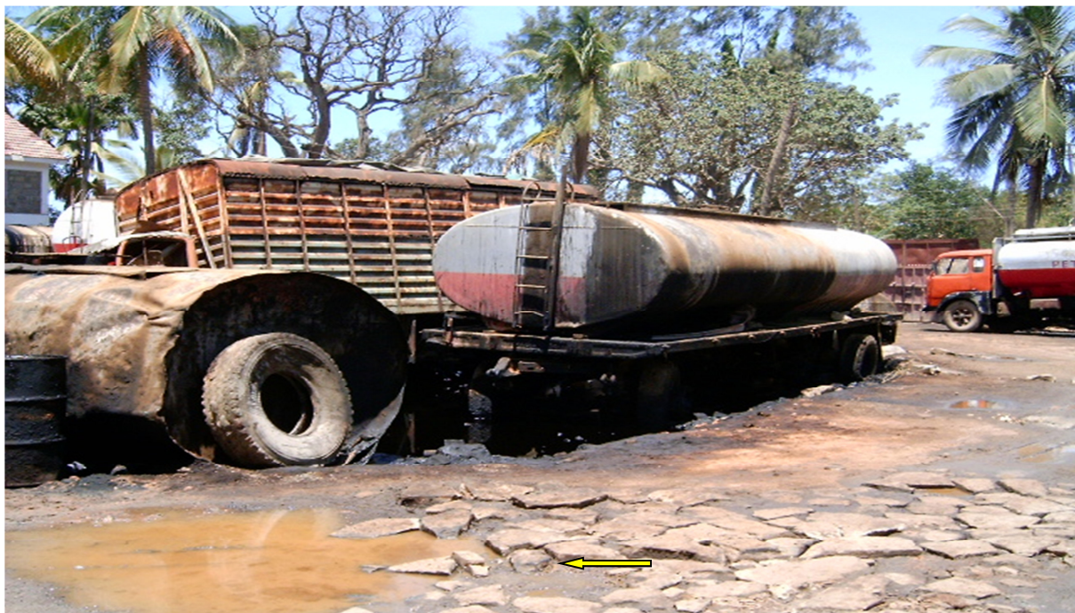
Fig. 5: One of the oil storage tanks at the premises. Note the pool of leaked-out oil with water below the storage tank (arrowed), and the results of attempts at rehabilitating oiled sections by spreading stones and murrum.

The most visible impact of the ballast water and oil sludge handling and processing activities at the facility is the extensive contamination of the soil with heavy fuel oil, resulting from leaks and spills during processing/storage operations. In the absence of proper waste oil handling facility on the site, oily waste had spread within the compound. In the middle of the plot, a 25 ton capacity storage tank had leaked, resulting in a thick layer of black oil (Fig. 5). It was estimated that between 60 and 70 % of the area within the plot not occupied by the office building was covered with oil, contaminating the soil and vegetation. The magnitude and persistence of the oil on the ground was demonstrated by the pools of oily water. Though large patches of areas had been covered with fresh soil to hide evidence oil spillage, its presence was still evident. The immediate impact of oil pollution on the soil surface was the loss of aesthetic beauty of site with the unpleasant looking patches of oil, reducing the amenity value of the property. Chronic oil pollution effects on the soil were manifested by the lack of vegetation including, impact to perennial plants and trees. Grass was non-existent, and mango and several coconut trees had defoliated and withered.