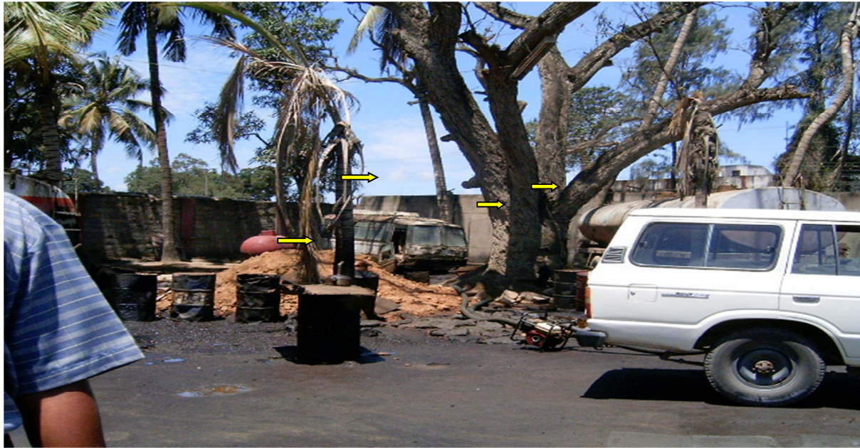
Fig.6: Impact of chronic oil pollution of the soil - withered mango and coconut trees (arrowed). Note the oil contaminated foreground and mound of fresh soil for covering the oil pools in the background.